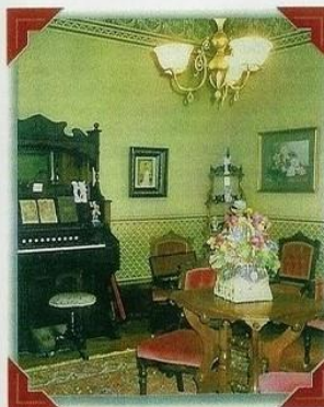
Parlor Room Elegantly Furnished

Listed on the National Register of Historic Places in 1977, one matching grant of $100,000 was received from the state of Missouri. Over $100,000 has been raised by gifts, memorials and fund raisers to restore the home. The Parlor Room has been elegantly restored by the Platte Purchase Daughters of the American Revolution. The remainder of the home is under the auspices of the Platte County Historical Society.