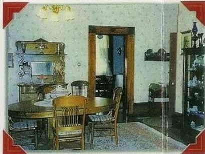
Formal Dining Room and Bringing Up Kitchen

Third and Ferrel Streets Platte City, Missouri