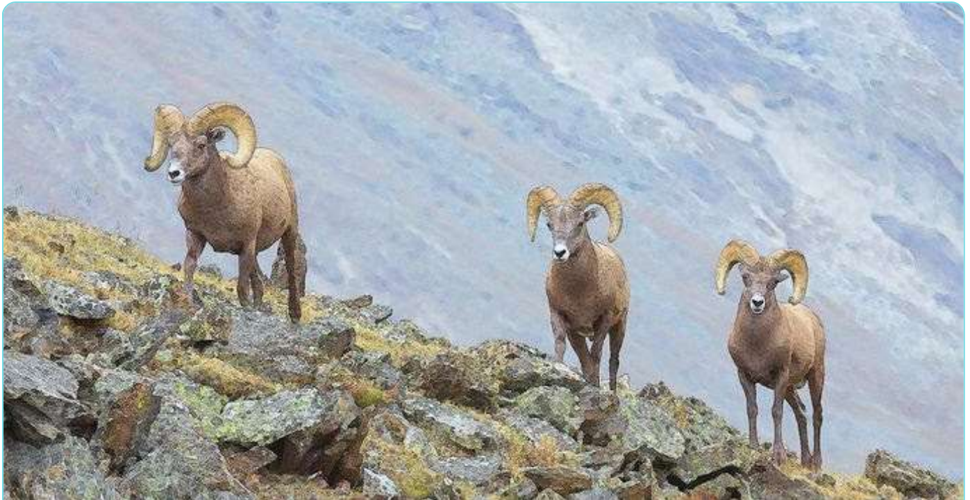
A squad of bighorn sheep eyeing me suspiciously in Rocky Mountain National Park on a visit a few years ago.