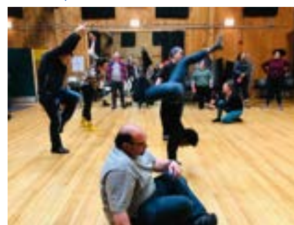
Daily Joy Workshop