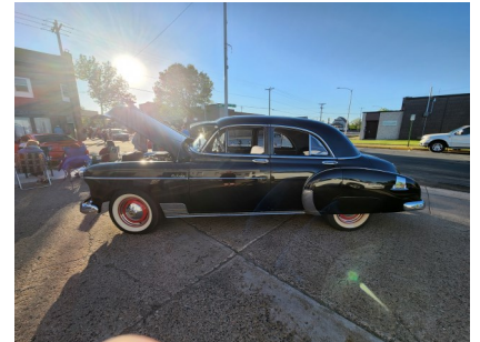
July Music on Miner Car Show & Concert Series