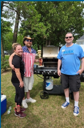
Rusk Area Burger Battle Best Burger Champions Cedar Lodge

The 2022 Rusk Area Burger Battle pitted several Rusk Area establishments against each other in an attempt to grab the trophy and the bragging rights of having the best burger in the Rusk Area. Live bluegrass music was rocked by Black River Revue. All burgers were excellent, but in the end there can be only one... The 2022 Rusk Area Burger Battle Best Burger Champion is Cedar Lodge!