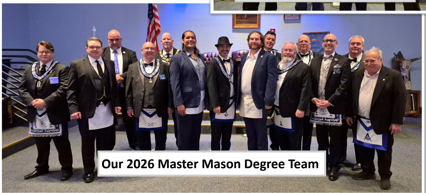
Our 2026 Master Mason Degree Team