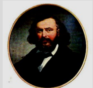
Albert Pike, 33°

"We must pass through the darkness to reach the light.." —Albert Pike