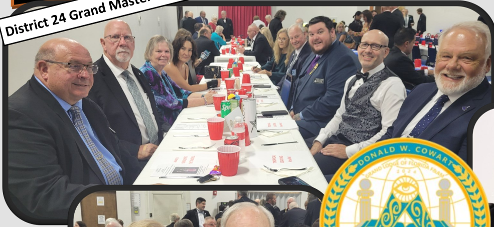
District 24 Grand Master Official Visit