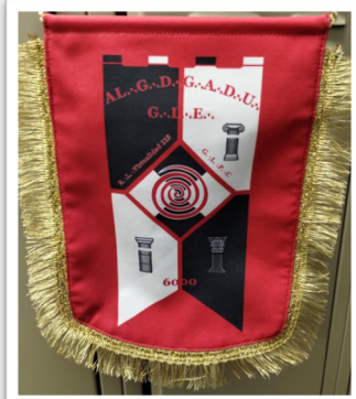
Flag for the Grand Lodge of Spain