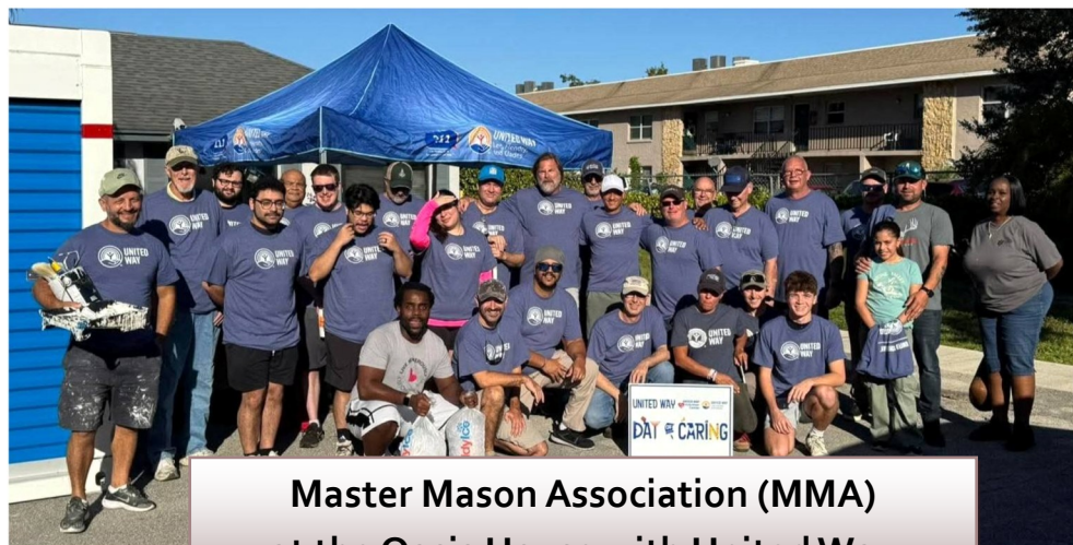
Master Mason Association (MMA) at the Oasis House with United Way