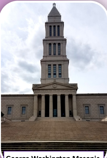
George Washington Masonic National Memorial