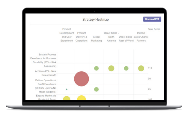
Figure 2: Risk heatmaps improve strategic decisions