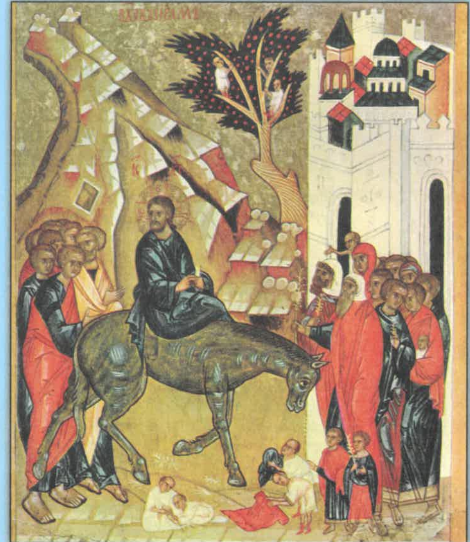
Icon of the Entrance into Jerusalem