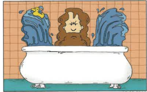
(See Exodus 14) MOSES WAS NOT HAPPY WHEN HE FOUND THAT HIS BATHWATER WAS PULLED FROM THE RED SEA

Church Attendance Saturday 3/2 – 62 (4:00 pm) Sunday 3/3 – 65 (9:00 am) Wednesday 3/6 – 27 (11:00 pm) Wednesday 3/8 – 24 (6:00 pm)