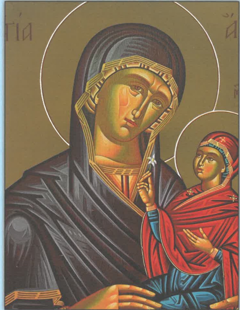
Icon of Saint Anna and the Mother of God