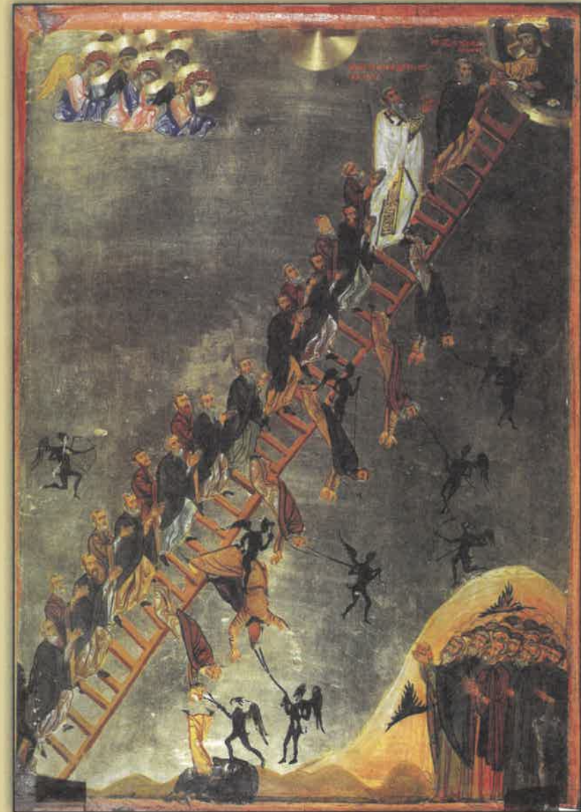
Icon of the Ladder of Divine Ascent