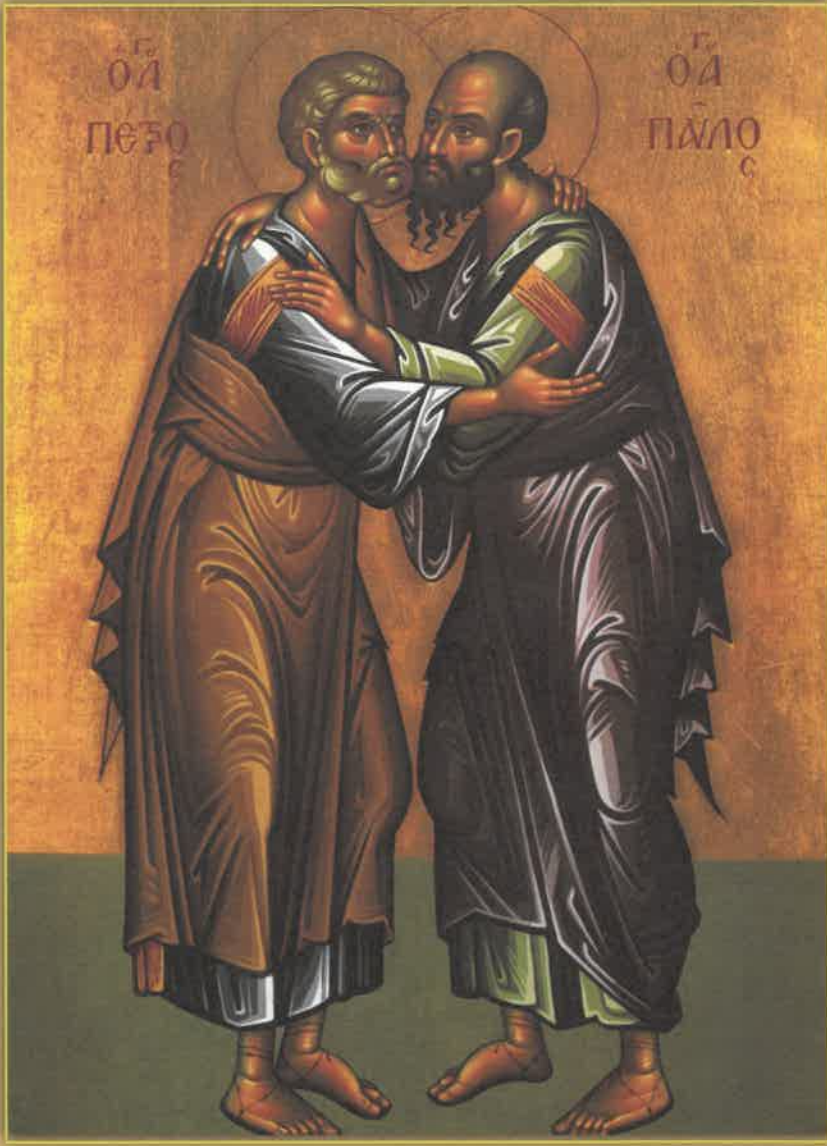
Icon of Saints Peter and Paul -- June 29th