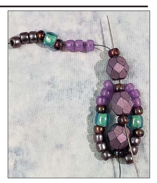
b) Pull snug.

a) String 1 Fire Polish, 1A, 3B, 1A, 1 6/0 seed bead, 1A, and 3C. Let beads slide towards the beadwork. Bring needle through the A, Fire Polish, A of the previous step and the Fire Polish and A of the new beads being added.