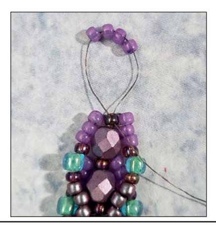
Step 9: a) Bring needle up through the three B beads on the right.