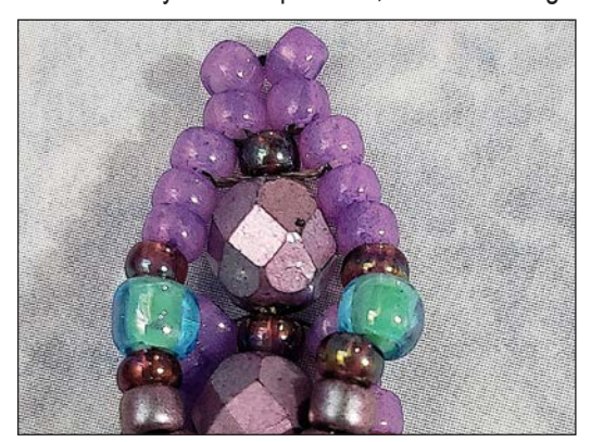
Step 10: Reinforce the end loop by going through the beads again in the same way as in steps 8 & 9, without adding beads.