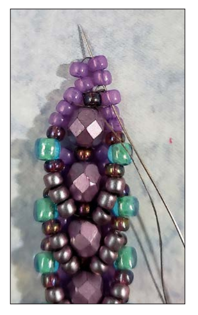
Step 9: a) Bring needle up through the three B beads on the right.