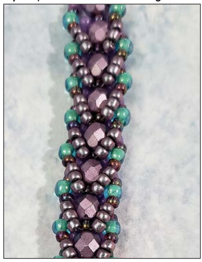
Step 7: Sewing beads together to make a secure ending:

a) Bring needle down the B bead next to the middle A bead. Then go back up the middle A bead. Pull snug.