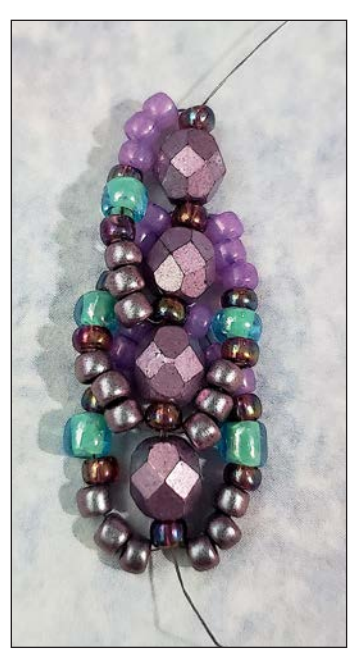
b) String 3B, 1A, 1 6/0 seed bead, 1A, and 3C. Bring the needle through the same five beads. Pull snug.

a) String 1 Fire Polish, 1A, 3B, 1A, 1 6/0 seed bead, 1A, and 3C. Let beads slide towards the beadwork. Bring needle through the A, Fire Polish, A of the previous step and the Fire Polish and A of the new beads being added. Pull snug.