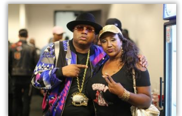
Many X's Patinum