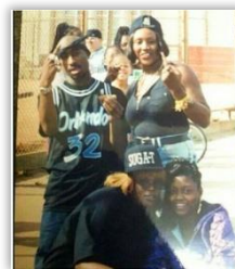
Suga-T & 2Pac