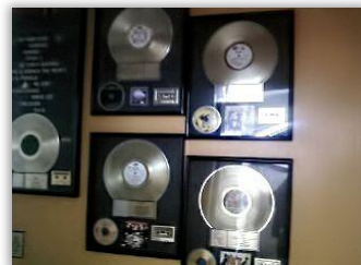
MULTI-PLATINUM & GOLD ARTIST