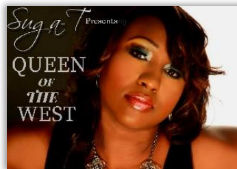
Queen of The West Album (Hip Hop Artist)