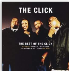
The Click Album (Legendary First Lady)

(Many X's Patinum) Multi-Genre Recording Artist