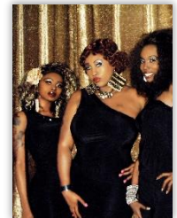
SHANICO-BAND Presents Suga-T