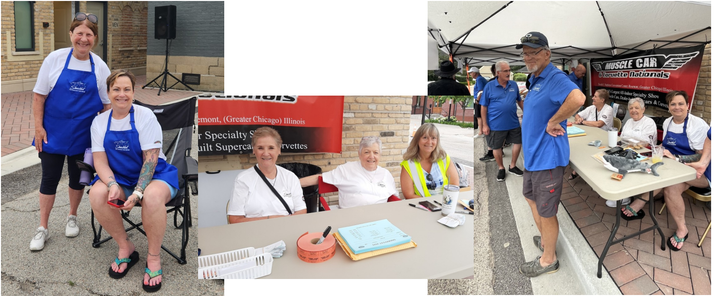
Some of our workers.