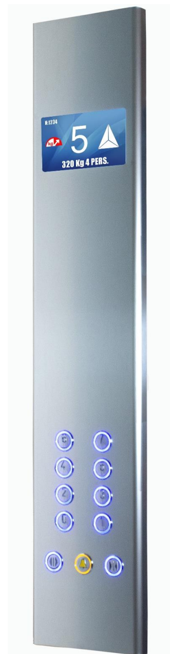
Half height side-hinged operating panels available in widths more than 130mm