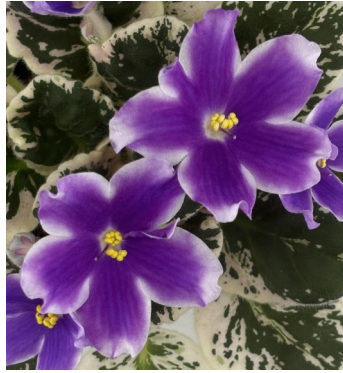
K's Simply Put