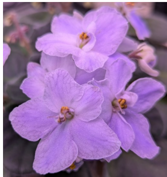
Peggy Rios (7935) 10/08/1993 (H. Pittman)