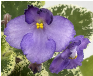
Suncoast Lavender Silk (7239) 11/04/1989 (S. Williams)