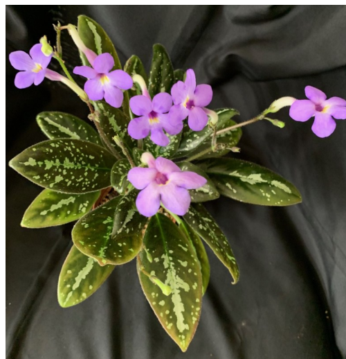
Michaelmoelleria vietnamensis

Send us an email and let us know how you are doing if you cannot attend the meetings. nybleb@aol.com or mlhard@verizon.net