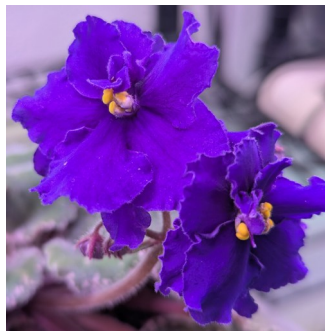
Tiger (3433) 06/01/1978 (L. Fredette)