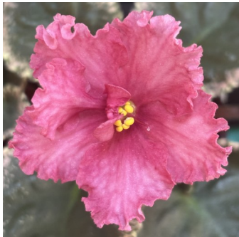
Buckeye Clockwork Orange