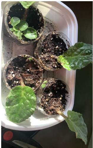
Optimara DaVinci Picture C

It had a gorgeous flower that “glistened” like it had been spray painted with a soft glitter (picture B). Unfortunately, when I repotted it, I lost the mother plant. I took several leaf cuttings when I repotted - always “in case” - and the first leaves grew! I was so excited! (picture C) To my shock, when the first plant bloomed it was a PINWHEEL! (picture D) Pretty, but nothing like the mother plant. When the second plant bloomed, it was like a Monet watercolor - mottled (picture E).