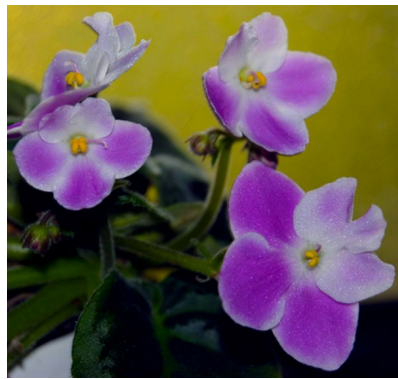
Optimara DaVinci Picture B