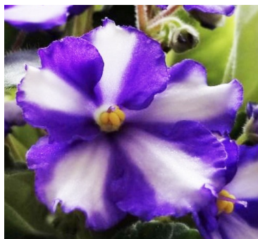
Optimara DaVinci Picture D

It had a gorgeous flower that “glistened” like it had been spray painted with a soft glitter (picture B). Unfortunately, when I repotted it, I lost the mother plant. I took several leaf cuttings when I repotted - always “in case” - and the first leaves grew! I was so excited! (picture C) To my shock, when the first plant bloomed it was a PINWHEEL! (picture D) Pretty, but nothing like the mother plant. When the second plant bloomed, it was like a Monet watercolor - mottled (picture E).