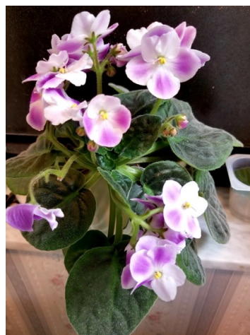
Optimara DaVinci Picture A

I have been an amateur African violet grower for 40+ years on/off. I have grown minis and standards. I do not use wick watering - always top water and use clay pots. I quickly learned that I couldn't grow them on the pool deck in the summer - too hot/muggy. I was successful growing on the bathroom windowsill (west frosted glass) and east window with a shelf. I purchased grow lights and set them for 8 hours. My story to share is what happened with my Optimara DaVinci "thumb print" (8319). The flowers were beautiful, but the plant grew lopsided (picture A).