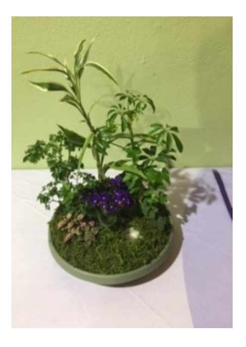
Best Dish Garden: Pat Rutzke