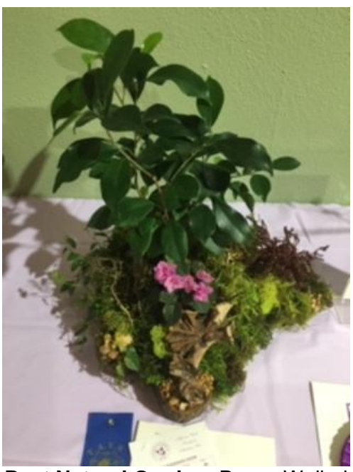
Best Natural Garden: Peggy Waibel