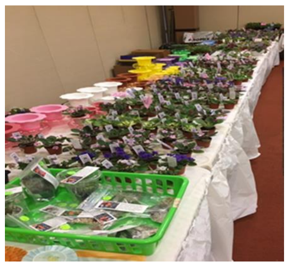
AVCF Show sales room