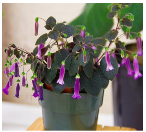
Sinningia 'Deep Purple Dreaming'

Disclaimer: While the information and recommendations in this publication are believed to be correct and accurate, neither the authors or editor, nor the Tampa African Violet Society can accept responsibility for any errors or omissions. Tampa African Violet Society makes no warranty, expressed or implied, with respect to the material herein