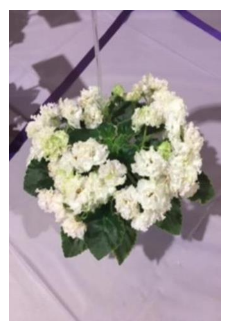
2nd Best in Show: "Lil Glimpse O Spring" Angela Newell