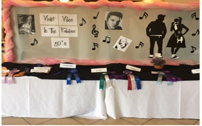
AVCF Show focal Point