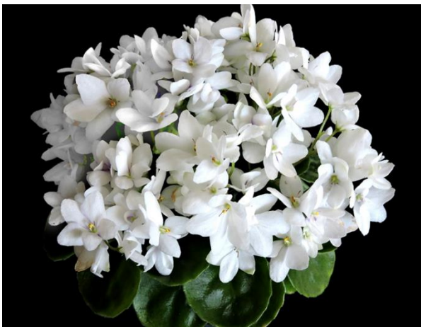
Broadway Star Trail, by Pamela Van Durme, TAVS