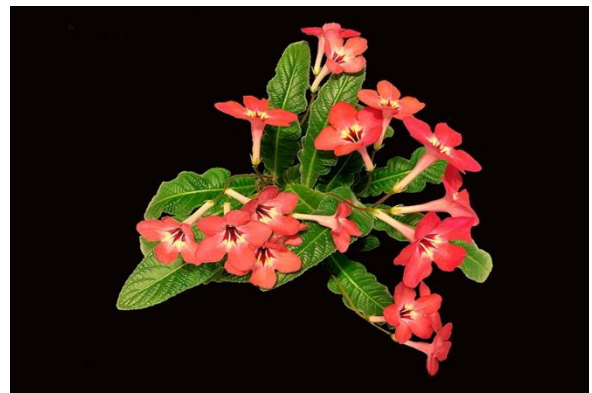
Streptocarpus 'Salmon Sunset' by Terry Jordan