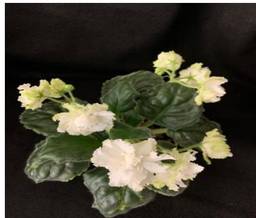
RM- Royal Laces