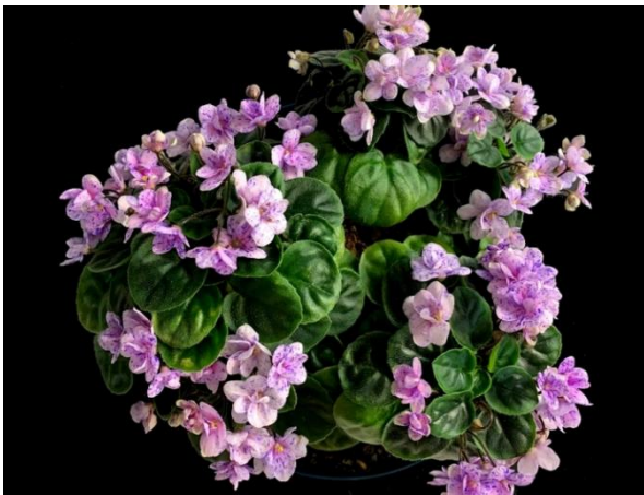
Rob's Boolaroo