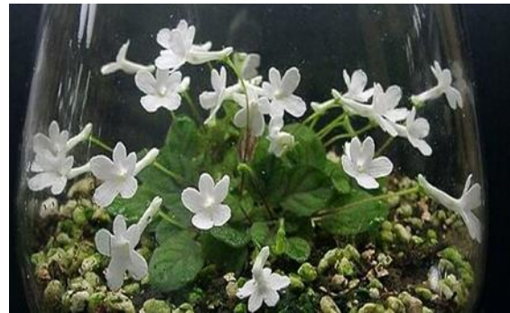
SINNINGIA "WHITE SPRITE"

Sinningia is a genus of about 75 species, most of which are native and/or endemic to Brazil. They are easy to grow and don't require a lot of space.