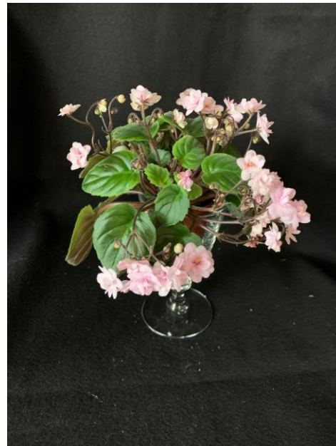
Rob's Vanilla Trail