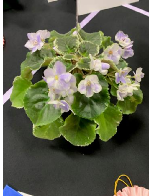
FROSTY FROLIC SANDI SOTO