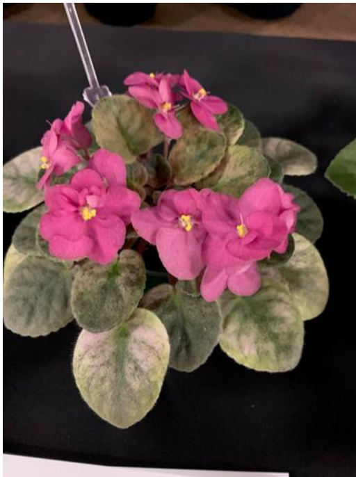
ROB'S SLAP HAPPY -2 ND BEST IN SHOW SANDI SOTO