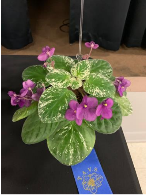
HAPPY HAROLD – BEST IN SHOW SANDI SOTO