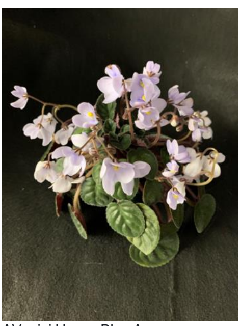
AV mini Honey Blue Ace