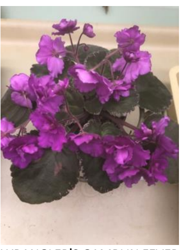
WRANGLER'S GAMBLIN FEVER