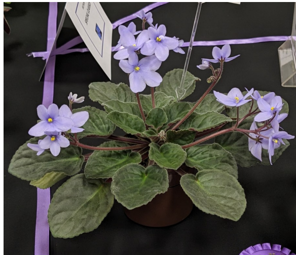
"Harbor Blue" Sandi Soto