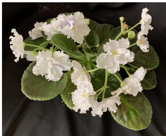
LE-Moonlight Sonata

Send us an email and let us know how you are doing if you cannot attend the meetings. nybleb@aol.com or mlhard@verizon.net