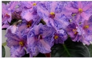
207 Cosmic Art (Sorano)

In July 2025, I ordered some Russian African violets from Elena at www.growviolet.com . They were shipped on 7/28 and received 7/31. Each cutting was well packaged. One of the cuttings I ordered was Cosmic Art (pic #1). Pic #2 is when first opened. Pic #3 was taken 11/7. Pic # 4 shows other cuttings from the same order. Very satisfied with the quality of cuttings from Elena at Grow Violet.