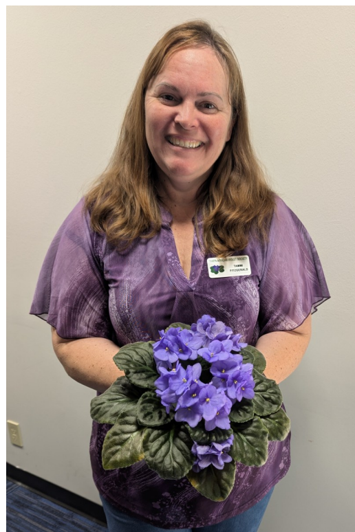
Steffano's Azure Diamonds (11157)

TAVS Holiday Party - Motion was made and seconded to hold the TAVS Holiday Party on a Saturday so working members could attend. The members discussed holding the club holiday party and club meeting on Saturday next month so that working members could attend. Because