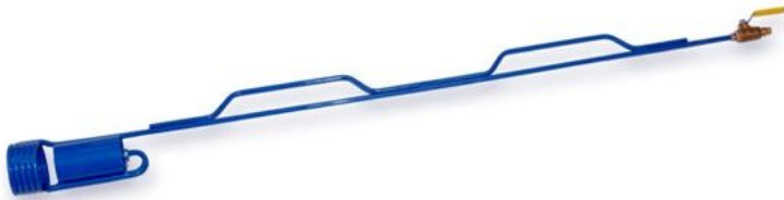
FL-3-L Torch Shown

For Torch Models: FL-3-L, FL-3-S, FL-6-L, FL-6-S, FL-8 and FL-10