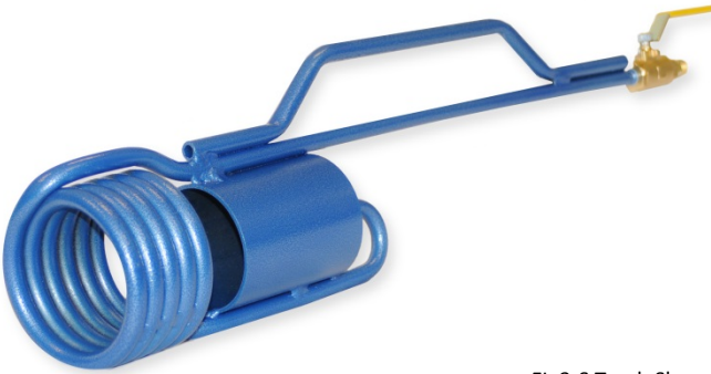
FL-3-S Torch Shown

For Torch Models: FL-3-L, FL-3-S, FL-6-L, FL-6-S, FL-8 and FL-10