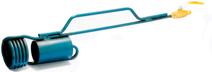
FL-6-S Torch Shown

For Torch Models: FL-3-L, FL-3-S, FL-6-L, FL-6-S, FL-8 and FL-10