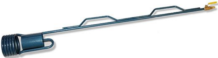
FL-8 Torch Shown

For Torch Models: FL-3-L, FL-3-S, FL-6-L, FL-6-S, FL-8 and FL-10