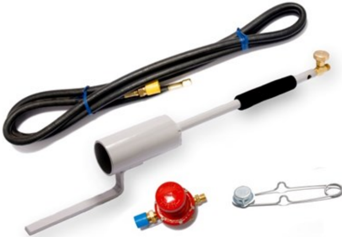
FV-11-S-K Torch Kit Shown

For Torch Models: FV-11-S, FV-20, FV-21, FV-30, FV-31 and FV-50