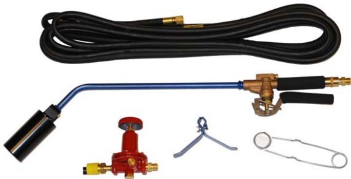
FV-15-K Torch Kit Shown