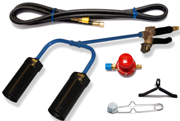
FV-17-K Torch Kit Shown

EZ SHRINK The Professional Shrink Wrapping Torch