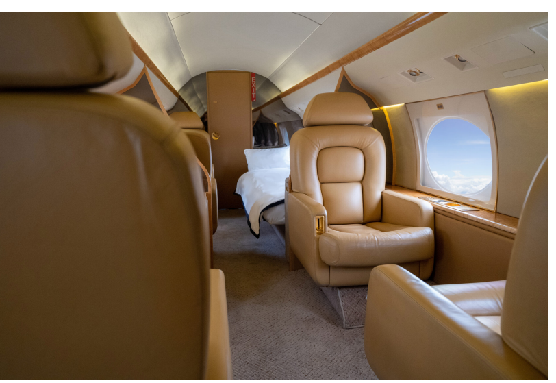
THESE SPECIFICATIONS ARE PRESENTED AS INTRODUCTORY INFORMATION ONLY. THEY DO NOT CONSTITUTE REPRESENTATIONS OR WARRANTIES OF ANY KIND. ACCORDINGLY, YOU SHOULD RELY ON YOUR OWN INSPECTION OF THIS AIRCRAFT TO VERIFY CORRECTNESS. THE AIRCRAFT IS SUBJECT TO PRIOR SALE, AND/OR REMOVAL FROM THE MARKET.