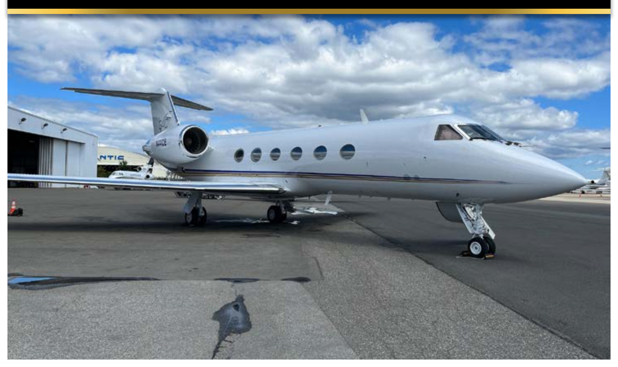
THESE SPECIFICATIONS ARE PRESENTED AS INTRODUCTORY INFORMATION ONLY. THEY DO NOT CONSTITUTE REPRESENTATIONS OR WARRANTIES OF ANY KIND. ACCORDINGLY, YOU SHOULD RELY ON YOUR OWN INSPECTION OF THIS AIRCRAFT TO VERIFY CORRECTNESS. THE AIRCRAFT IS SUBJECT TO PRIOR SALE, AND/OR REMOVAL FROM THE MARKET.