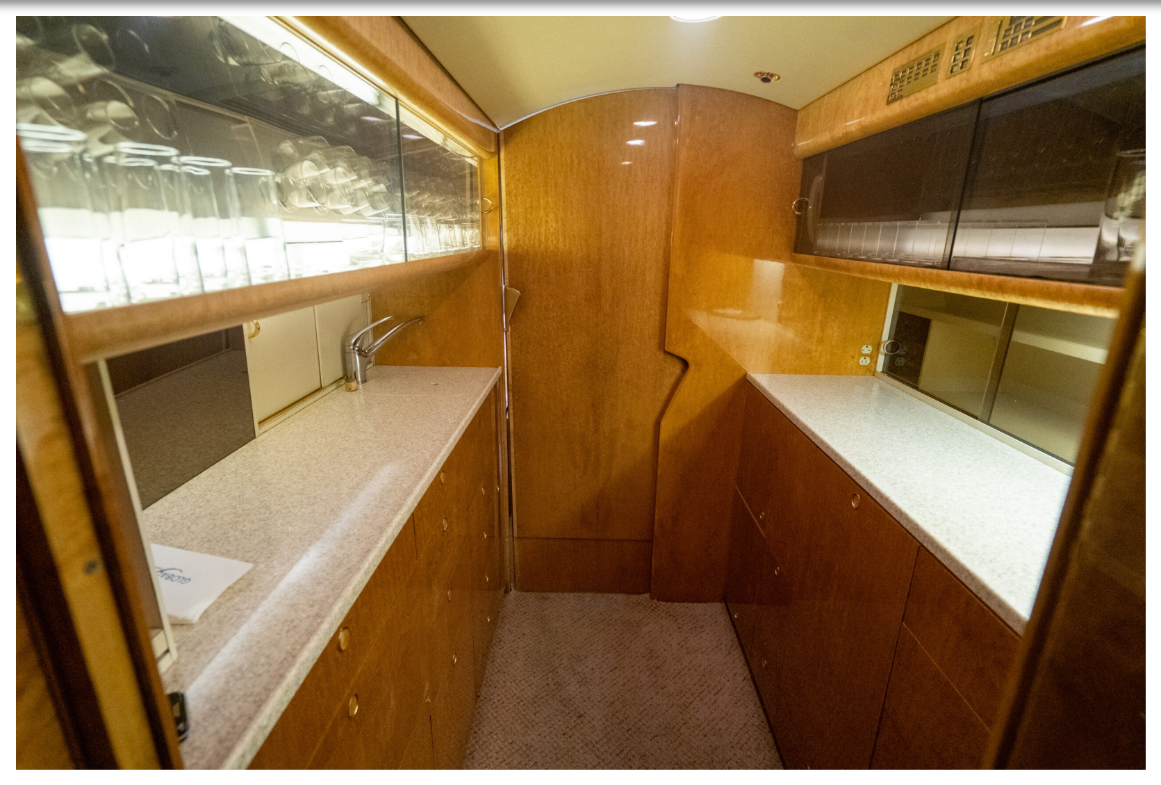
THESE SPECIFICATIONS ARE PRESENTED AS INTRODUCTORY INFORMATION ONLY. THEY DO NOT CONSTITUTE REPRESENTATIONS OR WARRANTIES OF ANY KIND. ACCORDINGLY, YOU SHOULD RELY ON YOUR OWN INSPECTION OF THIS AIRCRAFT TO VERIFY CORRECTNESS. THE AIRCRAFT IS SUBJECT TO PRIOR SALE, AND/OR REMOVAL FROM THE MARKET.