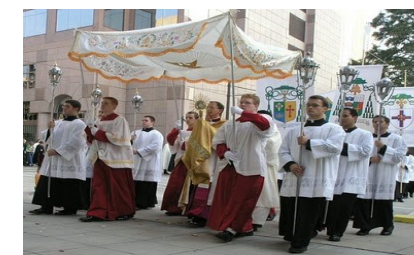
This Sunday, is the Solemnity of Most Holy Body and Blood of Christ. As an honor of the Eucharist we will do the Eucharistic procession outside.