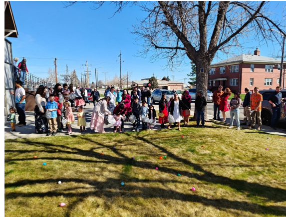
Kiddos all lined up for the Annual Easter Egg Hunt after Mass!

God is good all the time: All the time God is good!