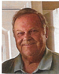
Bill Navel Database