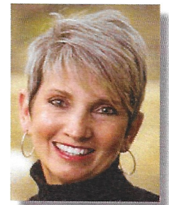
Terrie Rhodes Newsletter/Website