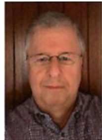
Jim Trautschold Street Lights