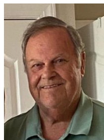
Bill Navel Database/Facebook