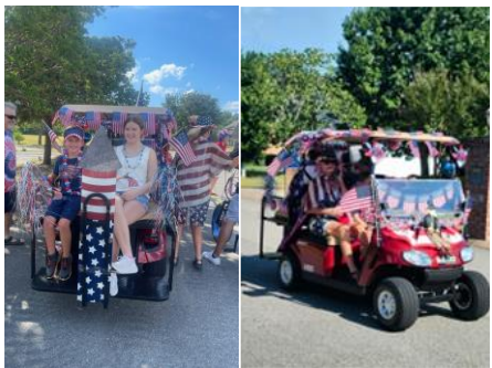
Neighbor 2 nd Annual 4 th of July Parade