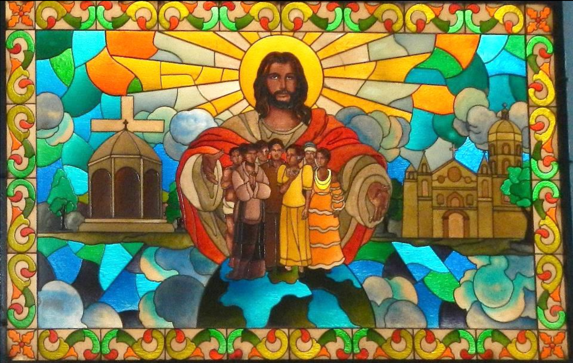
Christ Cares for All -- Lady of the Nativity Parish Church, Natividad, Philippines