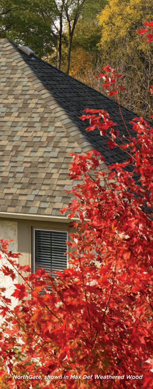
NorthGate, shown in Max Def Weathered Wood