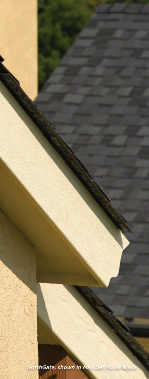
NorthGate, shown in Max Def Moire Black