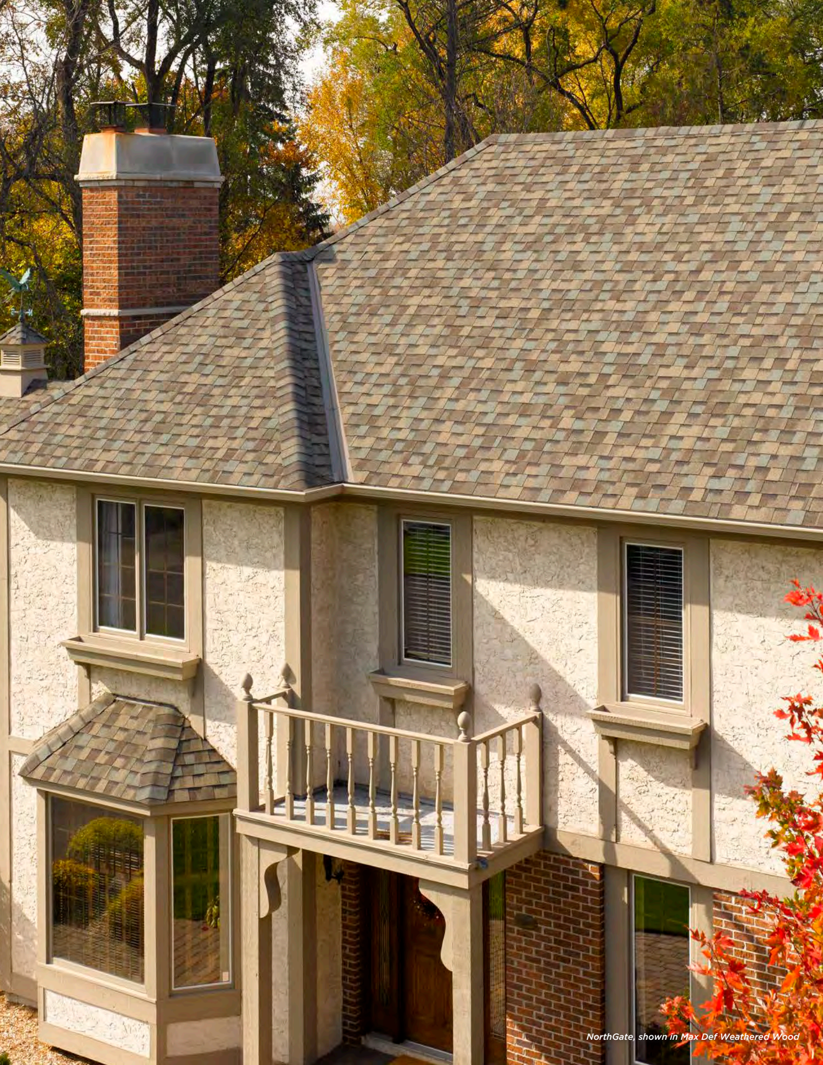
NorthGate, shown in Max Def Weathered Wood