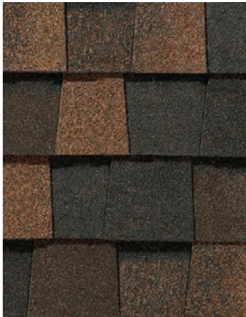
Max Def Burnt Sienna