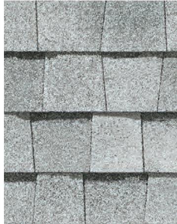
Silver Birch CRRC Product ID 0668-0072