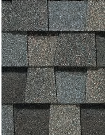
Max Def Weathered Wood