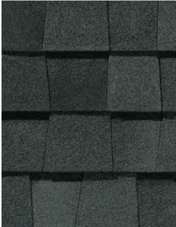
Max Def Moire Black