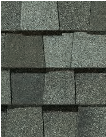
Max Def Granite Gray