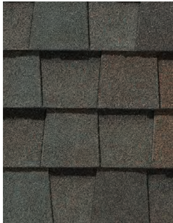
Max Def Heather Blend