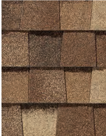
Max Def Resawn Shake