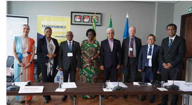
Africa Climate Week 2022, Gabon