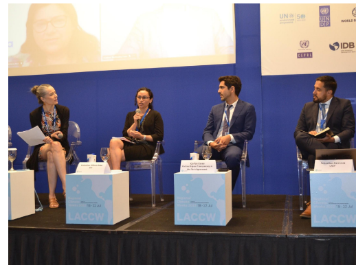
Transparency Events at LACCW 2022