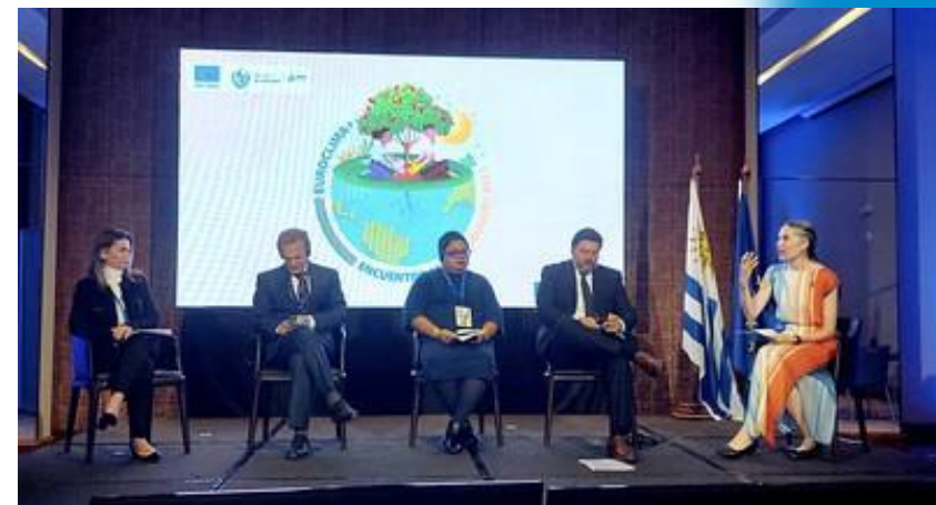
EUROCLIMA annual meeting in Montevideo, Uruguay