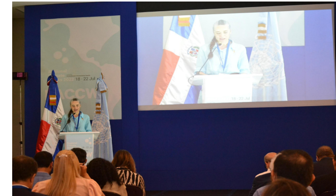
Closing Ceremony at LACCW 2022