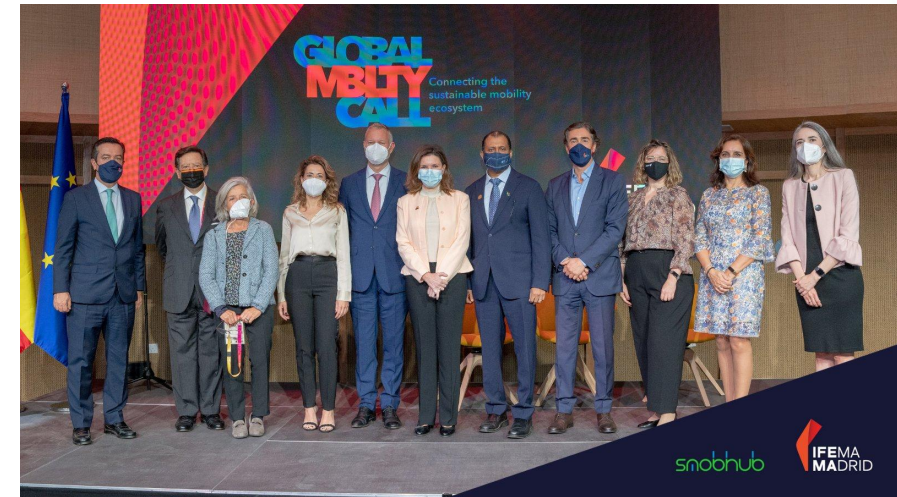
GMC presentation at Expo2020 Dubai