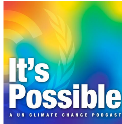
It's Possible Podcast Production