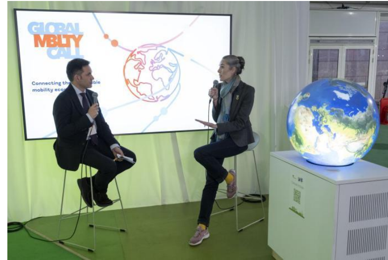
GMC presentation at COP26, Glasgow 2021