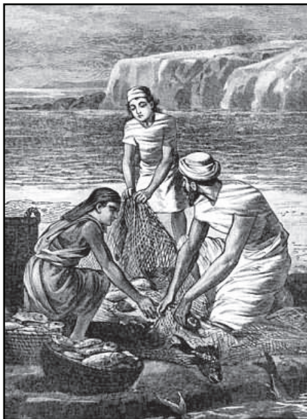
The wicked are taken away from the righteous in the parables of wedding and the good and bad fish.

stand," for, no escaping the fact, the Lord has set His hand to separate "the wicked from among the just," as is further seen