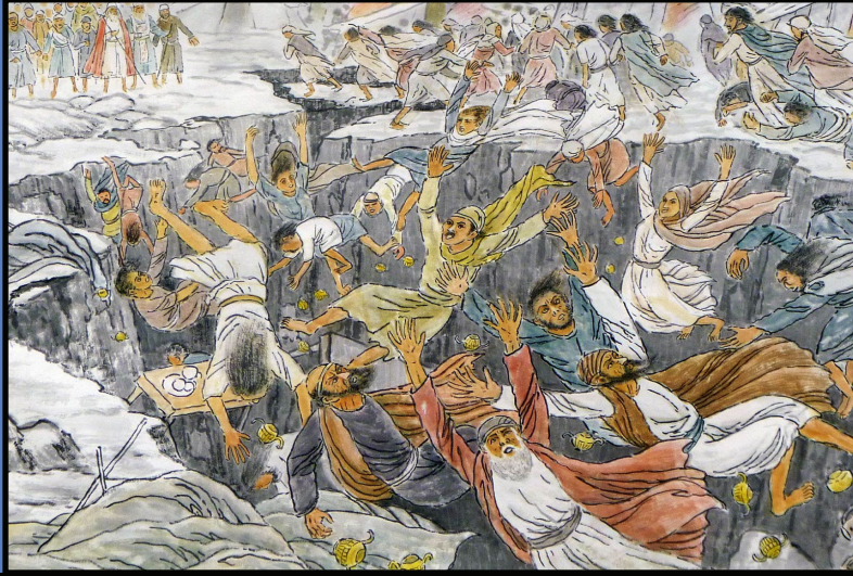
Shepherds that scatter: Korah, Datham, Abiram, their families, and sympathizers received the judgments of God because of their insolence (rebellion) against God's order of government.