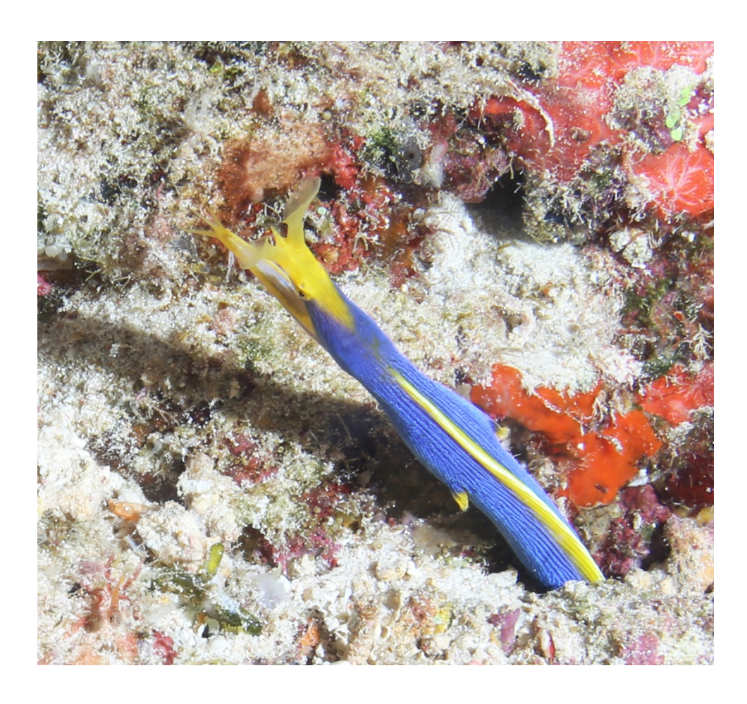
This is a "ribbon eel" I am told. He was not very big, maybe sticking out of the rocks by six inches.

I am not sure if this is a nudibranch or a flatworm.