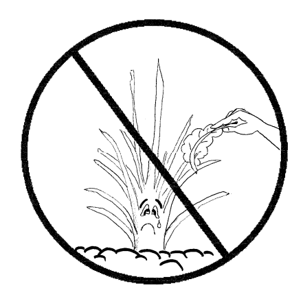
Never remove all the leaves from a single plant. Stop harvesting when slender leafstalks appear.