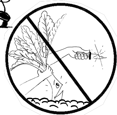
Cutting with a knife will leave a stub that will decay.