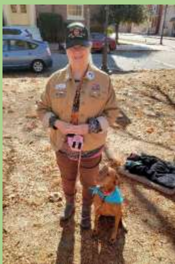
Our Pres and Dolly at Veterans Day Event on "The Green"