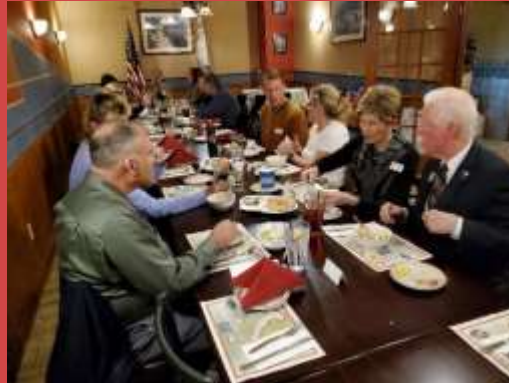
Above, right and below: Table-talk at November's meeting.