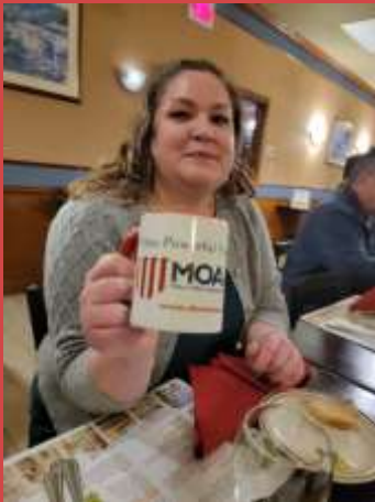
Our November guest speaker, sporting her new mug.