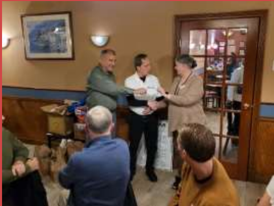
JROTC donation check presented by Nobles Pond military group.